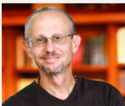
DAVID SIMON, M.D.

of more than 45 books in 25 languages with close to 30 million copies in print, Deepak is changing the way the world views physical, mental, emotional, spiritual and social wellness.